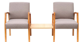
Bella featured with centre linking table