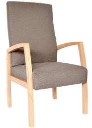
Bella High Back featured in Gin Rummy Gravel fabric