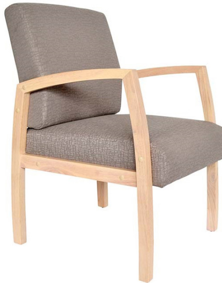
Featured in Gin Rummy Gravel fabric