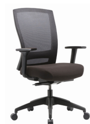
Featured with arms

The Buro Mentor offers the latest in contemporary and ergonomic design. The Mentor is a stand out candidate for any board room, office or home office environment. Featuring a complete range of ergonomic features, easy to use synchronised seating adjustments and outstanding comfort.