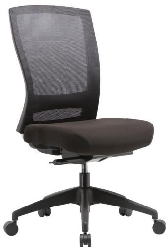
Buro Mentor chair with nylon base