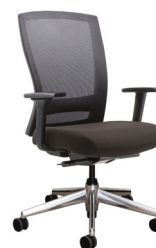
Featured with arms

The Buro Mentor offers the latest in contemporary and ergonomic design. The Mentor is a stand out candidate for any board room, office or home office environment. Featuring a complete range of ergonomic features, easy to use synchronised seating adjustments and outstanding comfort.