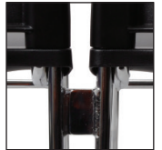
Envy with heavy-duty linking system (Indent only)