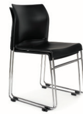
Envy stacked, black