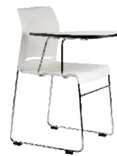
Envy with Tablet, white (Indent only)