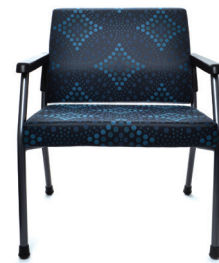
Featured without arms