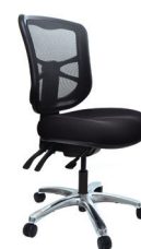
Featuring the Global GreenTag Cert™ Certified Metro Chair