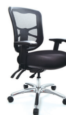
Featured with arms